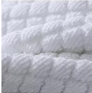
4. Jacquard design