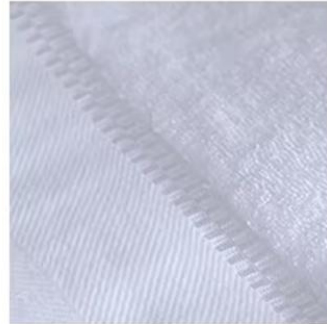
6. Silky border