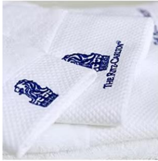
1. Embroidery logo