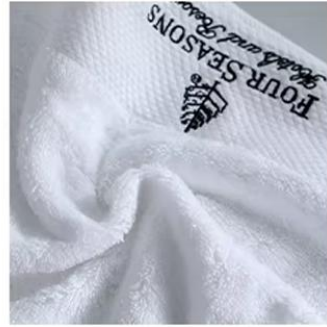
3. Diamond border