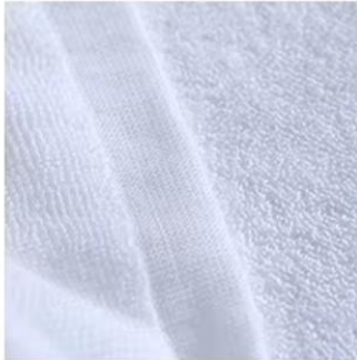
5. Dobby border