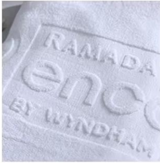
2. Woven logo